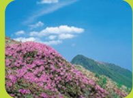
The view of Mt Kuju from Oigahana