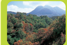
The view of Mt Mimata from Chojabaru